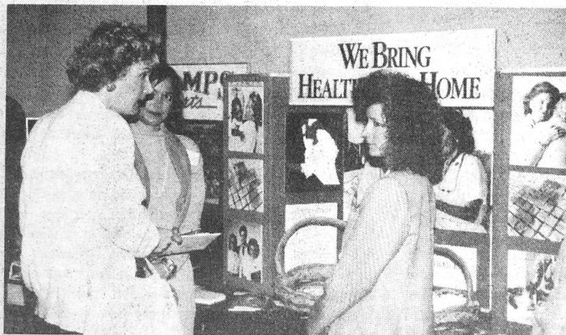
Students have the opportunity to meet with numerous business representatives during Business In Review.

guidelines for getting the most from Business In Review by reading their spring issue of Joblink and coming by the Office of Job Placement and Cooperative Education, D-208.