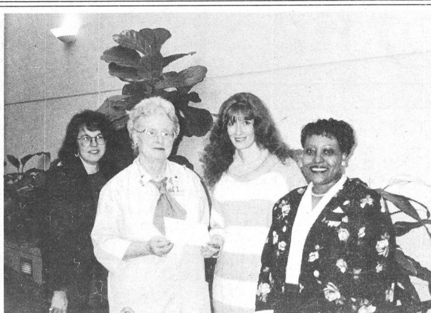
Special Photo /CSC Public Information

The menu consists of barbecue pork sandwiches and/or all-beef hotdogs. Platters include chips, cookies and a beverage. Platter prices are only $2.00 for a single (pork or hot dog) and $3.00 for a double (two pork sandwiches or two hot dogs or a combination platter with both sandwiches). Tickets go on sale at the registers in the Food Court, on Tuesday, January 3. Dinner participants will have priority in claiming seats for the 7:30 p.m. screening of The Lion King . The screening will take place in CE-101, adjacent to the atrium.