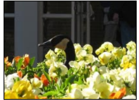
Mamma goose tries to make her nest outside the Student Center

□ Indeed, the day’s success can be summed up by this student’s comment: “Even though Clayton State was not my first choice, it is now. Everything was wonderful and I love the school.”■