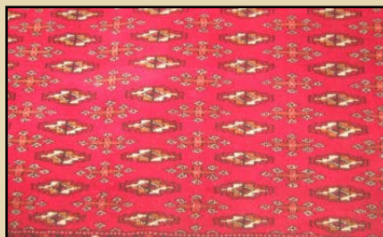
Close up of hand-made Persian rug. Everyone who makes a contribution to the Faculty/Staff Fund Drive is eligible to win.