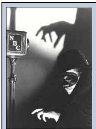
One of the most popular radio shows in history debuted in August 1930 when "The Shadow" went on the air. Clayton State Theater's production of "The Ghost Walk Again" comes from this classic program.