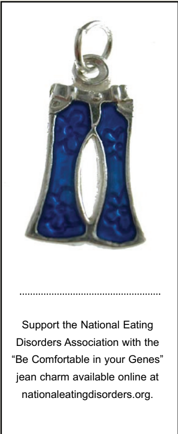
Support the National Eating Disorders Association with the "Be Comfortable in your Genes" jean charm available online at nationaleatingdisorders.org .