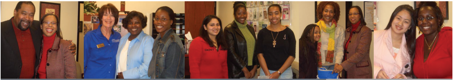
Photos from Feb. 14 Open House