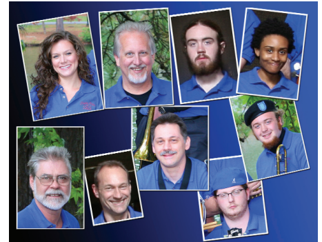
Clayton State University Jazz Combo