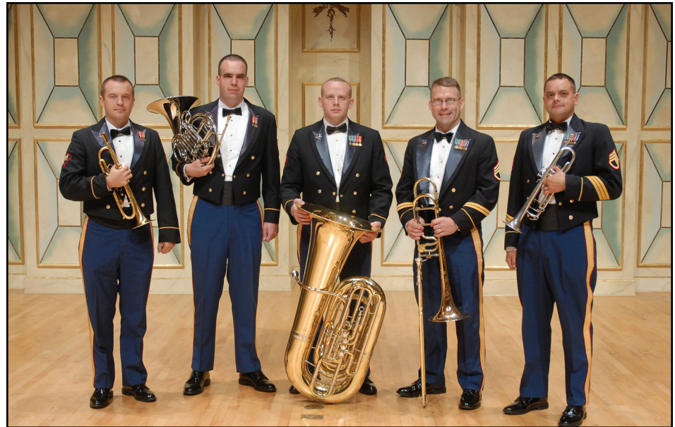
Army Ground Forces Brass Quintet