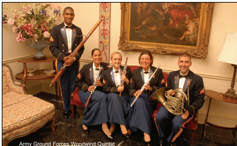
Army Ground Forces Woodwind Quintet