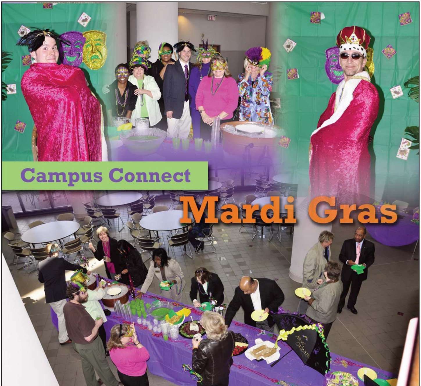
Faculty and staff gather in Harry S. Downs Center Atrium for Campus Connect on Feb. 23, 2009. The Mardi Gras-themed connect was hosted by Continuing Education and the School of Nursing.