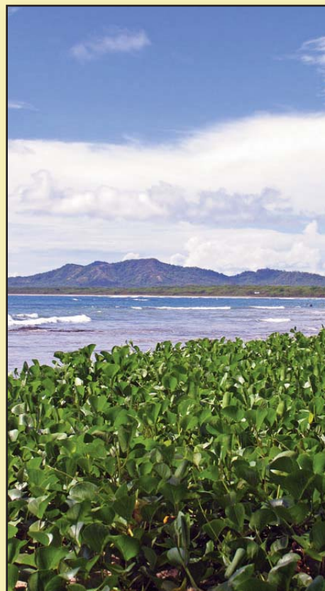
Tamarindo Beach, Costa Rica