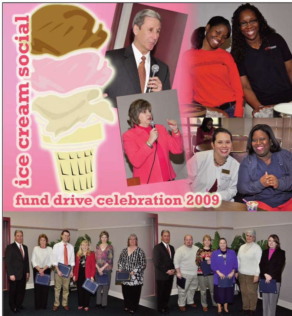
An ice cream social in honor of another successful Clayton State Faculty/Staff Fund Drive was hosted by the Office of Development in the Harry S. Downs Center.

This week's issue of the University System of Georgia's Legislative Update has been posted and is available for downloading at http://www.usg.edu/pubs/lu/ . Back issues of the newsletter are also available there.