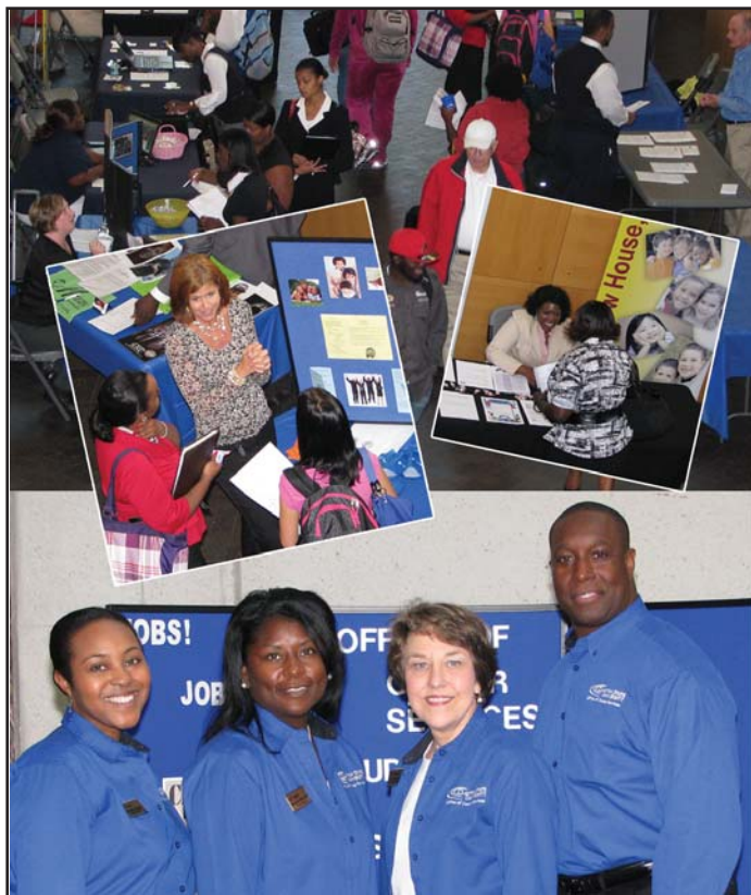
Fall 2010 Internship Fair