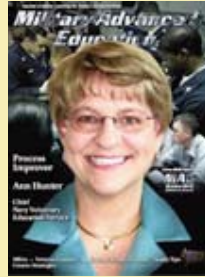
Military Advanced Education

Clayton State University has received the significant honor as a Top Military-Friendly Colleges and Universities honoree by Military Advanced Education magazine.