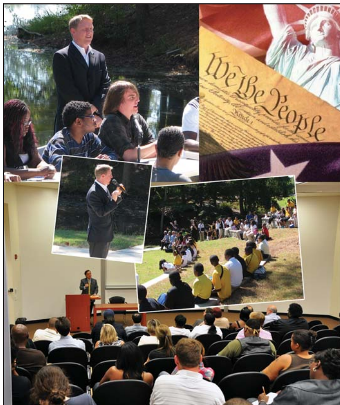
2010 Constitution Week Events