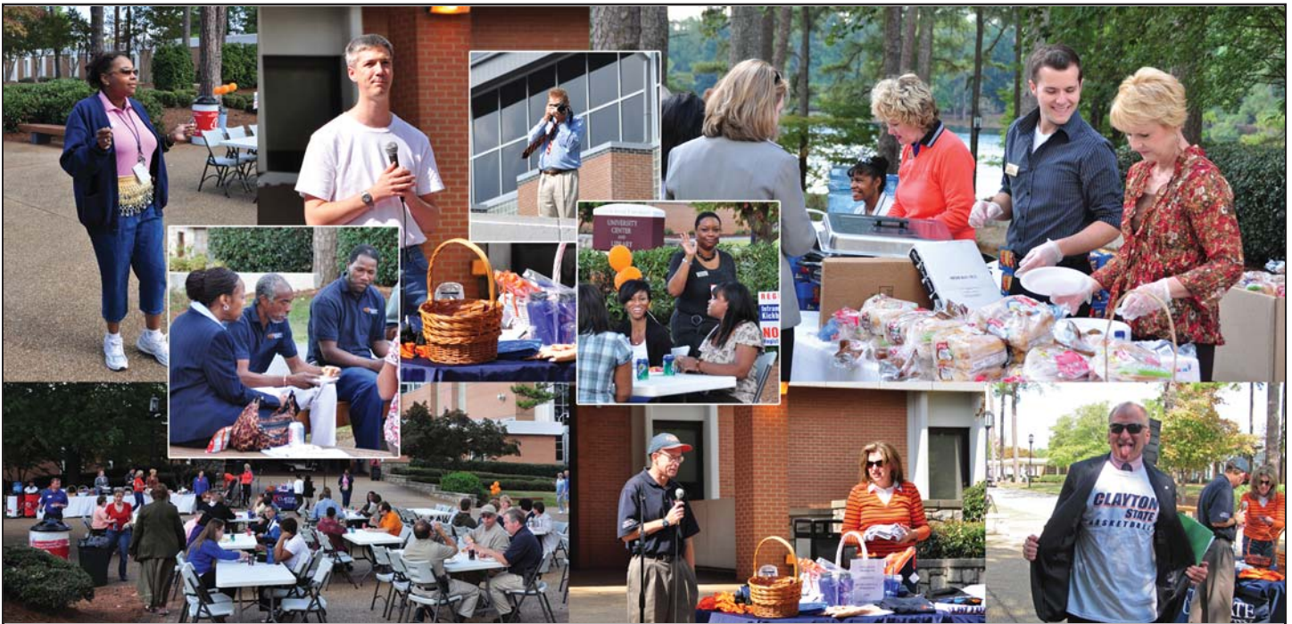
Faculty/Staff Fund Drive Hot Dog Rally 2010