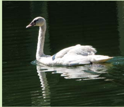
Clayton State's newest swan, Nancy, makes herself at home on Swan Lake.