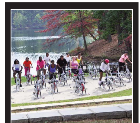
Recreation and Wellness held an "Outdoor Boot Camp Challenge" by the lake on Tuesday, Oct 12. Participants took part of a spin class outside at the amphitheater.

"I would like to say that given the opportunity I would continue to assist the Clayton County Board of Commissioners as a volunteer because I feel there is so much more I can learn and so many more influential people I can meet," he says. ■