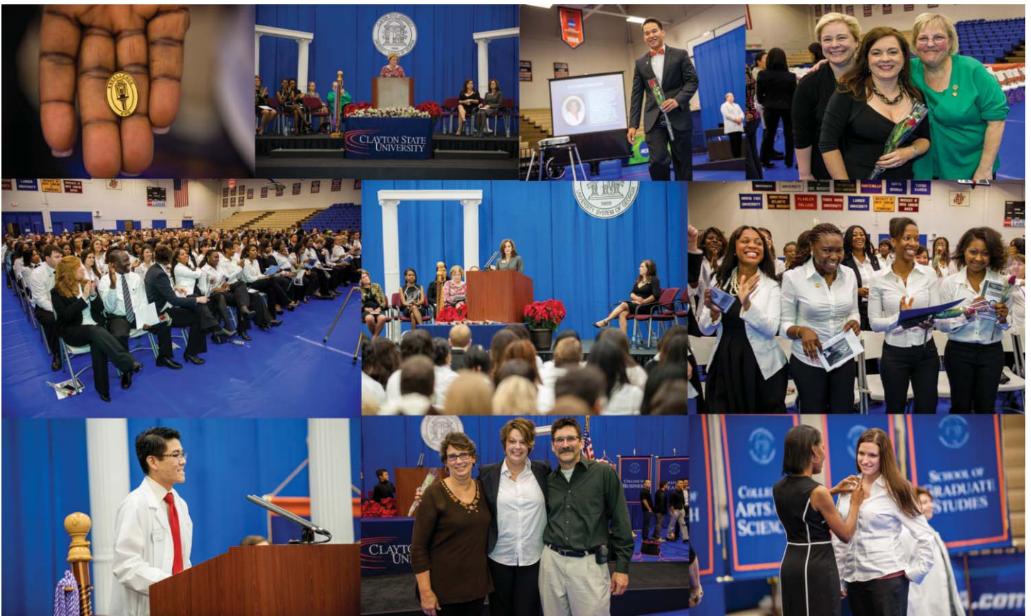
Nursing Pinning Ceremony Fall 2013