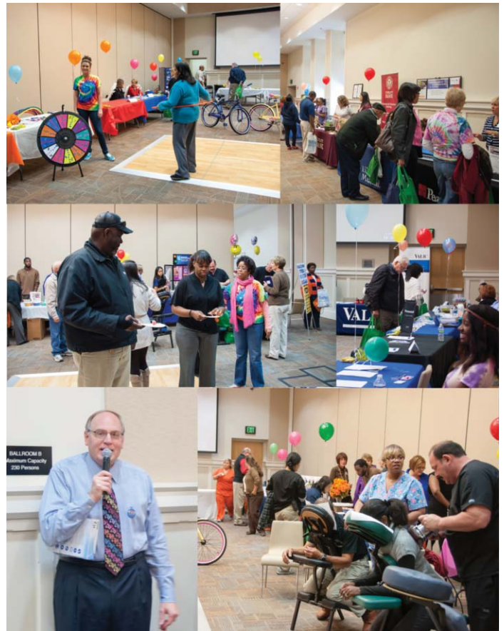
Clayton State employees attend the HR Benefits Fair