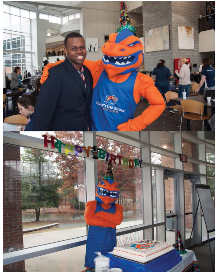
Loch's Birthday Celebration!