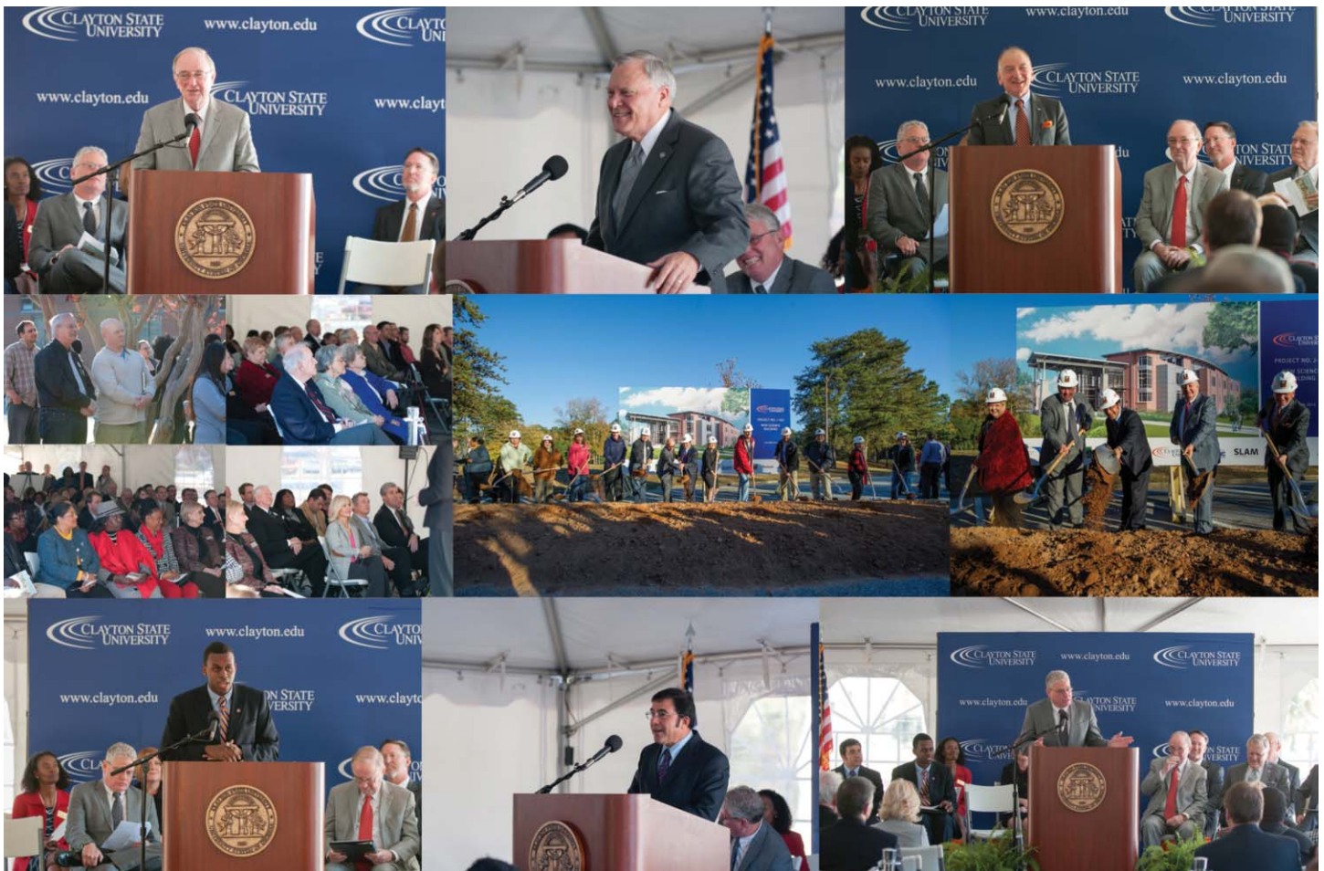
The Clayton State University Science Building Groundbreaking Ceremony

The new building will also include two, 64 seat classrooms; three, 36 seat classrooms; and 26 faculty offices, including offices for the department heads of biology and chemistry/physics. Additional spaces will include five small prep rooms; three for biology, and two for chemistry; and two conference rooms. ■