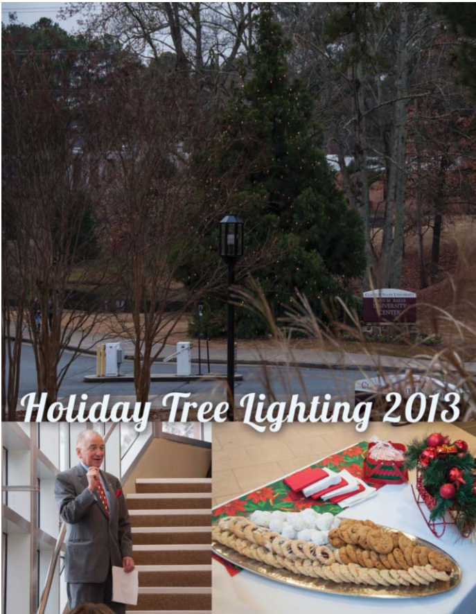
The annual holiday tree lighting