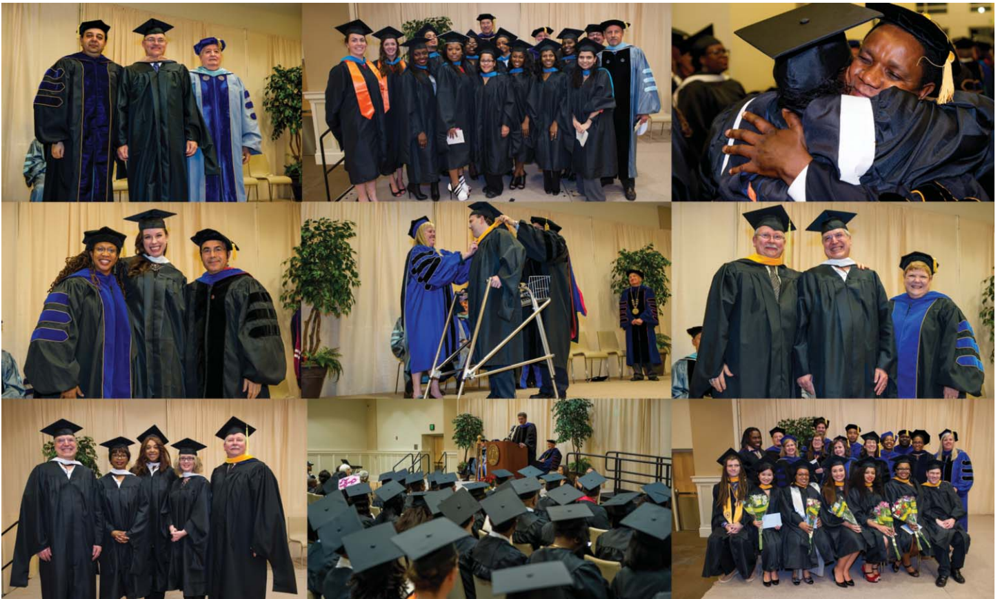
Graduate Hooding Ceremony Fall 2013