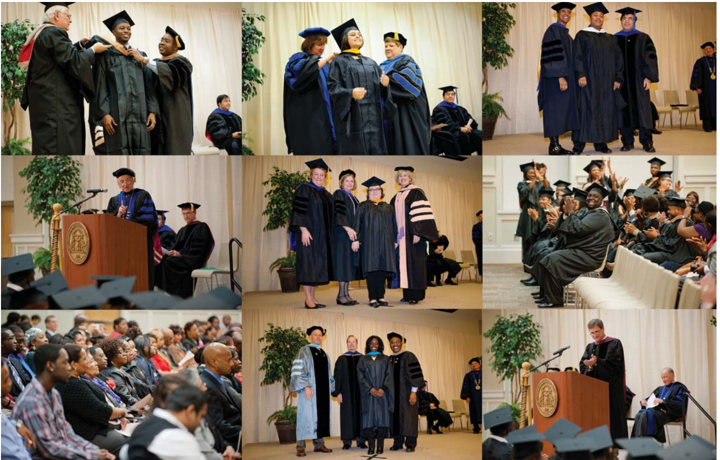
Kevin Liles