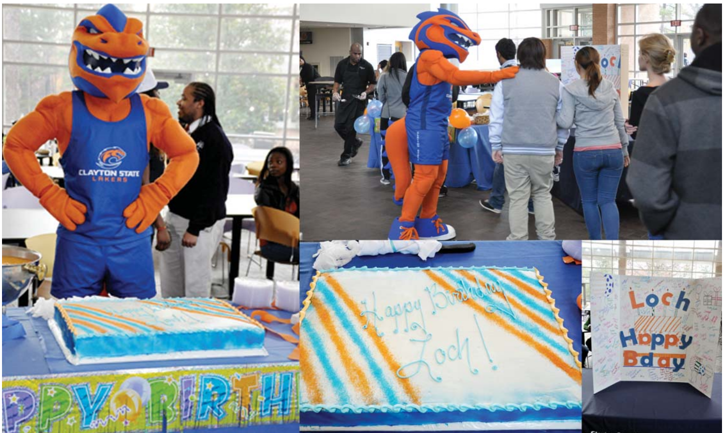
Happy birthday, Loch! The Clayton State mascot celebrated with cake and a birthday card in the James M. Baker University Center on Nov. 30.