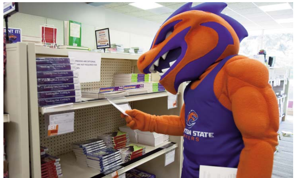
Loch shops the Loch Shop in-store and online at www.claytonstategear.com .

run monthly promotions (the current one is a gift with a $50 purchase) throughout the year as well. ■