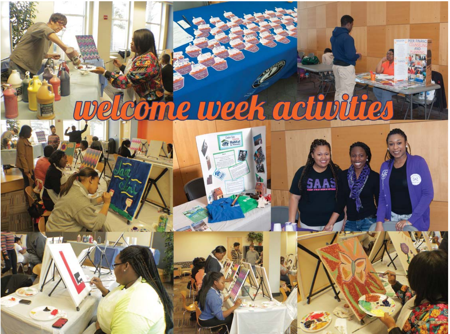
Students return to campus for spring 2014 and participate in a variety of Welcome Week activities to kick off a new semester.