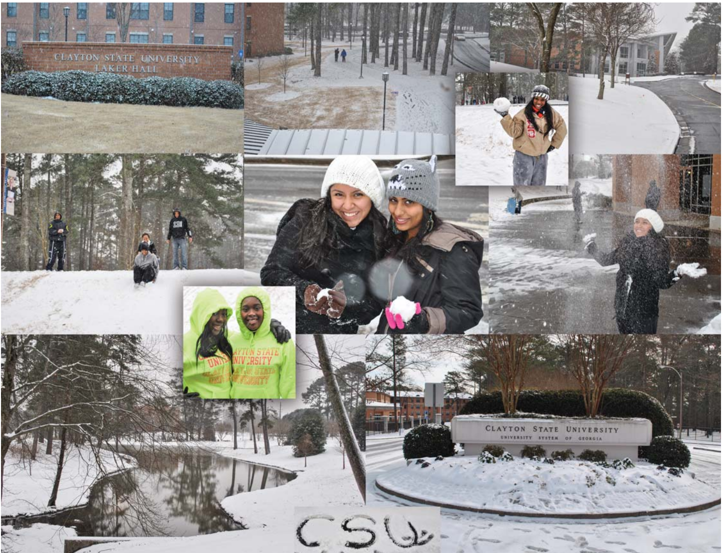
Snow Jam 2014 at Clayton State University

The National Committee on United States-China Relations has worked with the Chinese Ministry of Education and the U.S. Department of Education for more than 30 years in the implementation of an MOU signed by the two government agencies in the early 1980s. ■