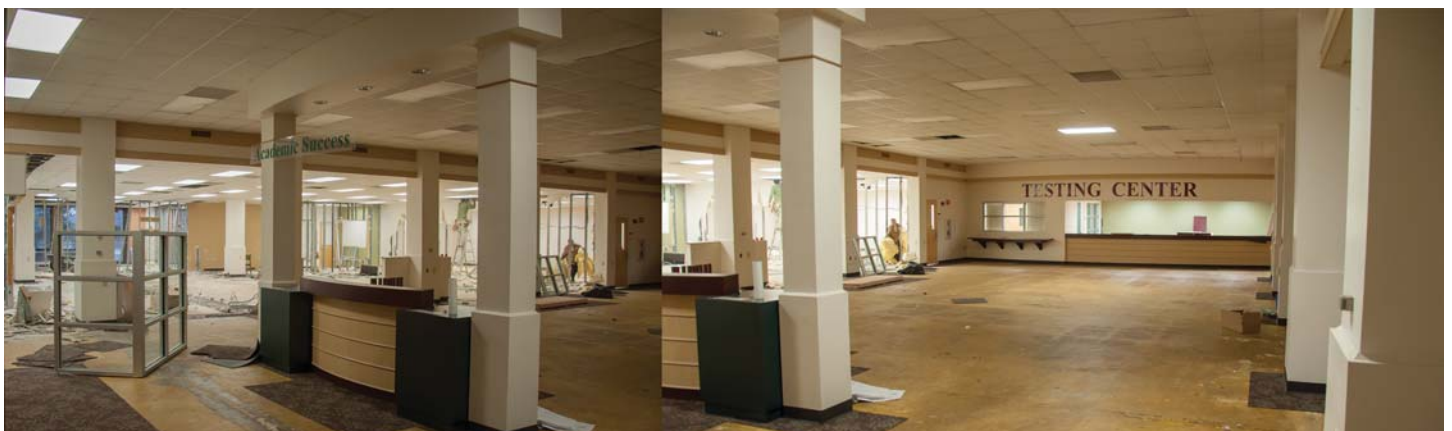
Library Renovation Progress