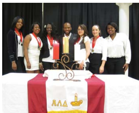
Photo Caption: a picture of the old and newly elected officers of the organization. The names of the students in the picture are: