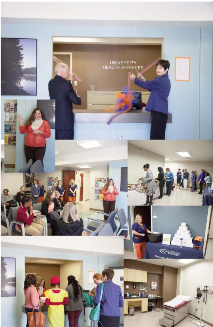
University Health Services Open House UHS is now located in the 1000 building at Clayton Station.