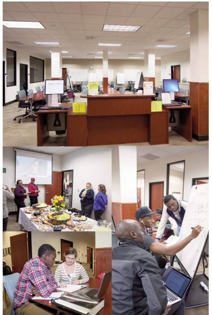
Center for Academic Success Open House CAS is now located upstairs in Edgewater Hall.