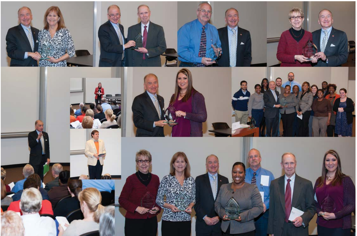
2014 Making Things Better Awards