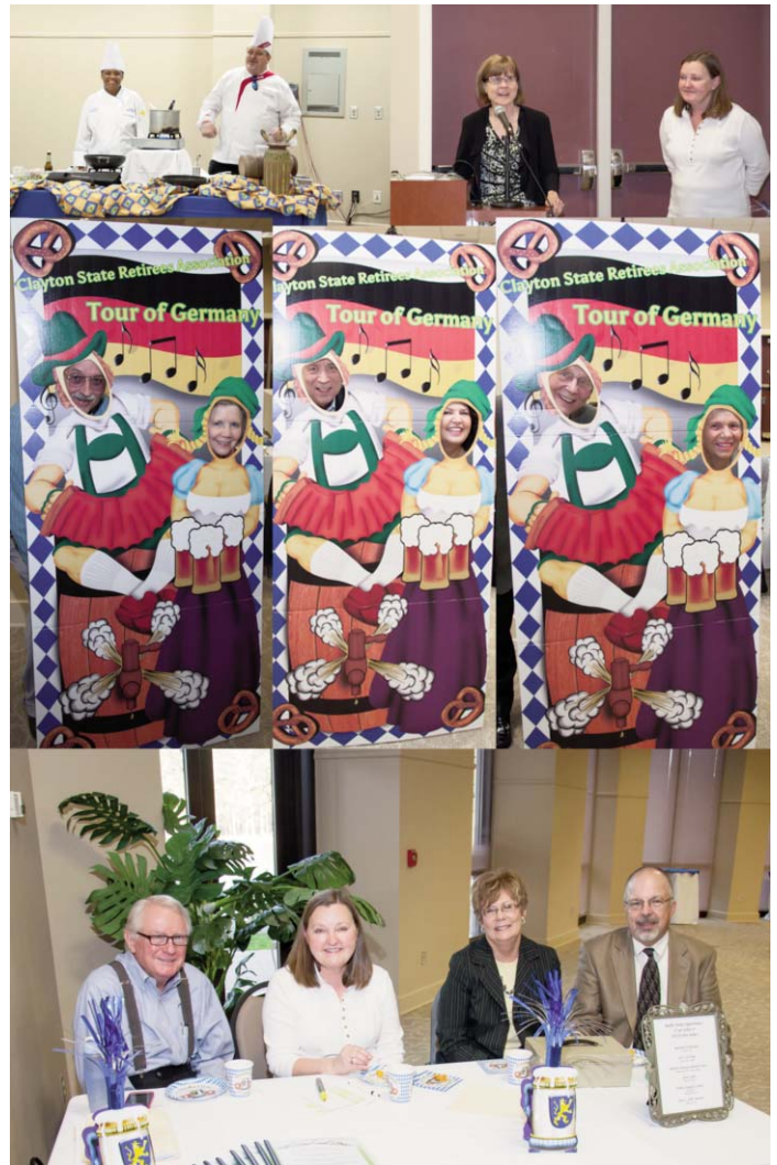
The Clayton State Retirees Association gathers for their annual dinner.