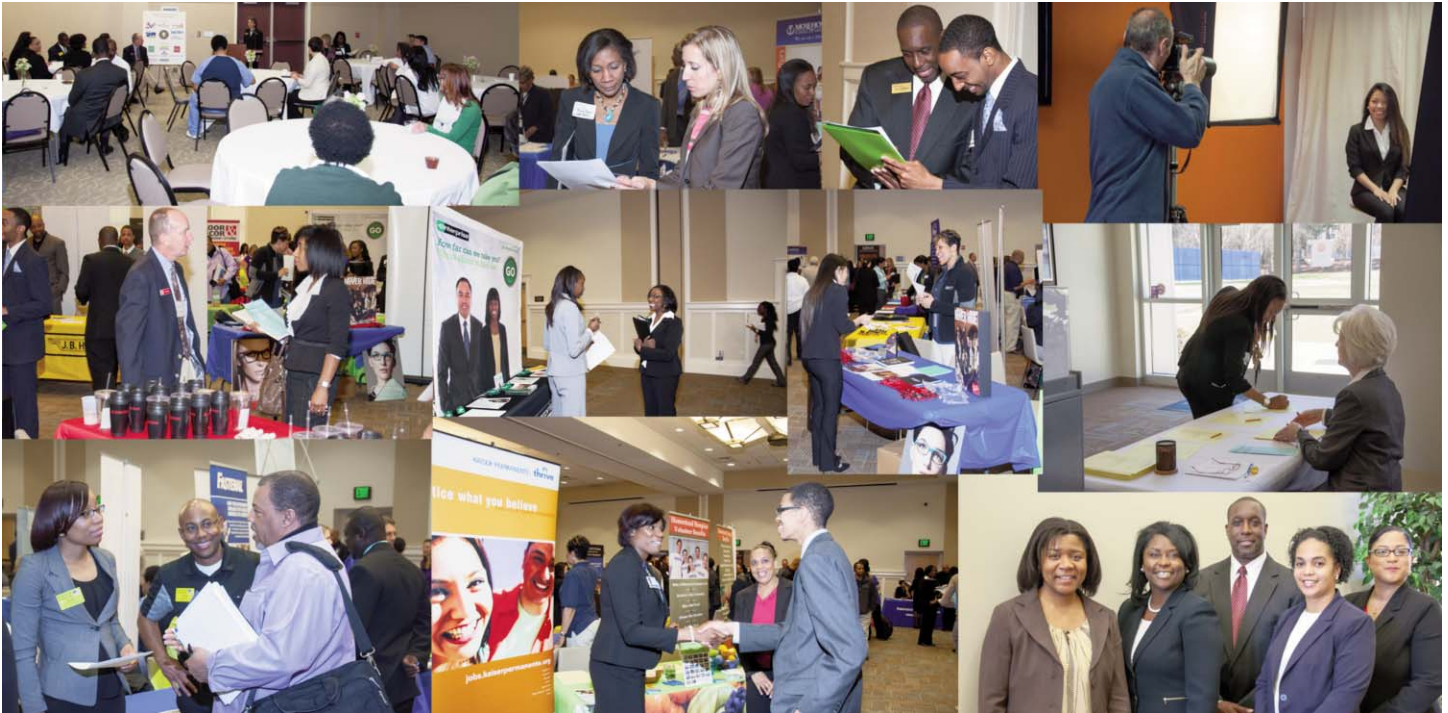
Career Services hosts its spring career fair in the SAC ballroom