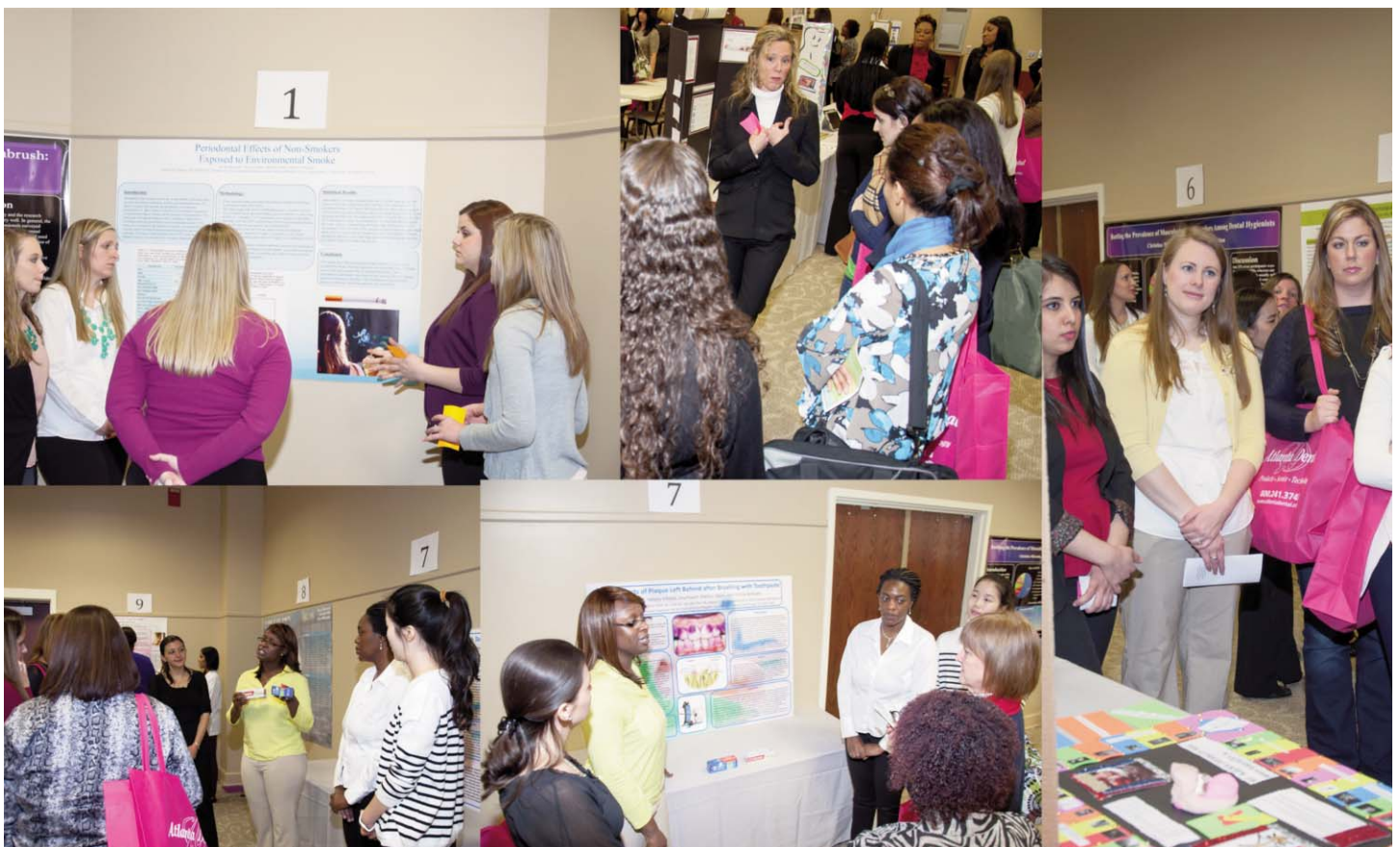
Dental Hygiene Research Day