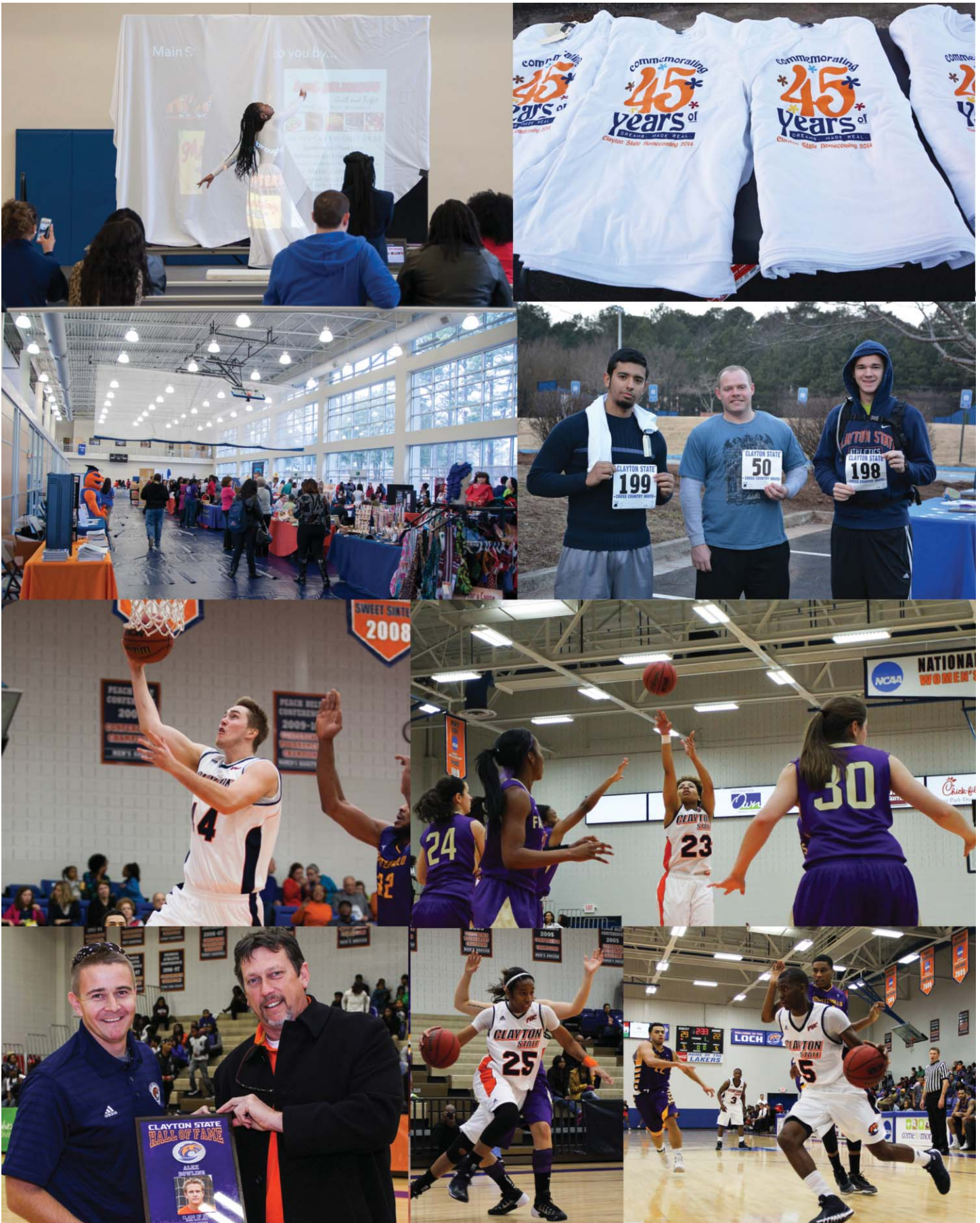
Clayton State Homecoming 2014.